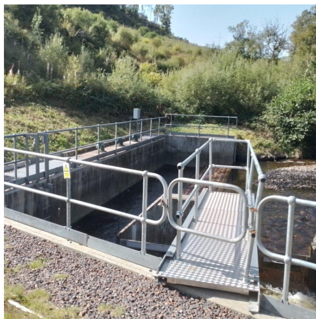
River Avich Hydro Scheme September 2023

This report is the third annual report of the River Avich Hydro Community Benefit Fund which is delivered by Foundation Scotland under an agreement with Awesome Energy (Dalriada) Ltd (AED).